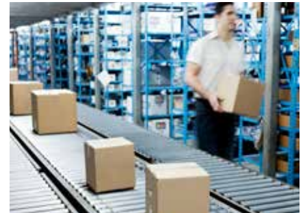
Manual Postal sorting